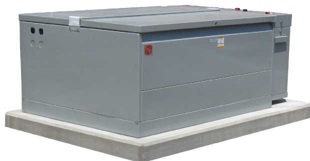
Discrete medium-voltage Remote Supervisory Vista, used in loop-feed configuration.

S&C Electric Company was chosen for its long-standing relationships with utilities and ability to work closely with Digital Realty's technical experts to meet their facilities' design and operational requirements. S&C provided engineering services, including control and relay programming. It also provided project management services and performed point-to-point system Level 4 commissioning. In addition, S&C supplied the switching and protection products, plus the smart grid communication and control solutions needed for a self-healing distribution system.